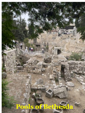
Pools of Bethesda