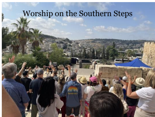
Worship on the Southern Steps

I experienced times of worship in His overwhelming presence in places like the Southern Steps of Jerusalem's Temple Mount, the amazing Sea of Galilee, the Garden Tomb and at TBN Jerusalem as well as many impromptu spontaneous times when, like at the Mount of Olives, we broke out into worship as 300 of us walked the path to the Garden of Gethsemane. Many tears were shed by us all as we soaked and met with the Lord in worship throughout our time in this wonderful place.