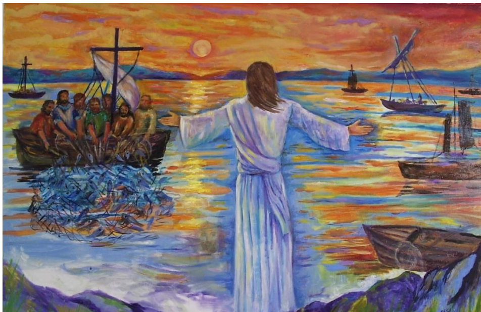
The Miraculous Catch of Fish - John 21: 1-14